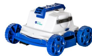
Robot Robot RKJ14